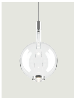
Sky-Fall Round large