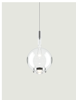
Sky-Fall Round medium