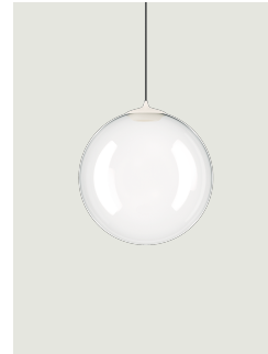
Random Solo 23