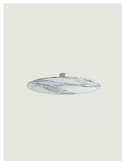
Puzzle Mega round large - Renoir