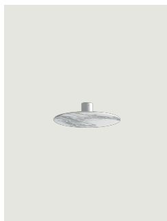
Puzzle Mega round small - Renoir