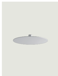
Puzzle Mega round large