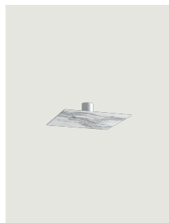
Puzzle Mega square small - Renoir