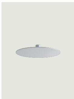
Puzzle Mega round large