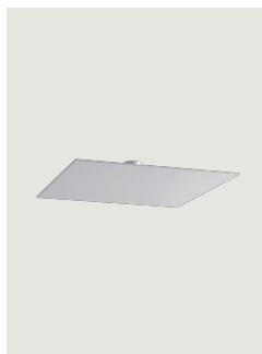
Puzzle Mega square large