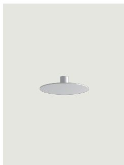
Puzzle Mega round small