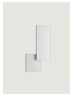
Puzzle Outdoor square & rectangle