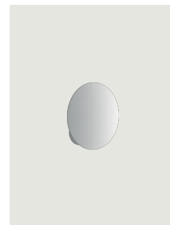
Puzzle Outdoor round single