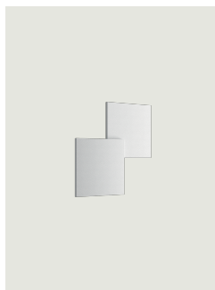
Puzzle Outdoor double square